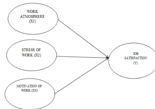
Picture 1. Conceptual Framework

Conceptual framework of this research is described on this picture